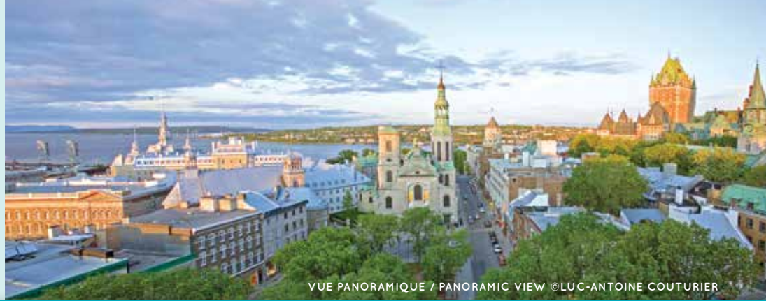
VUE PANORAMIQUE / PANORAMIC VIEW

Québec City, Canada August 6 th to 10 th 2018